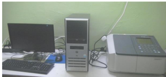
UV - Visible Spectrophotometer

wavelength(s) is absorbed by (or transmitted through) a solution. Transmittance (T) is the ratio of transmitted light to incident light. Absorbance (A) = -\log T . Absorbance is usually the most useful measure, because there is a linear relationship between absorbance and concentration of a substance. This relationship is shown by the Beer-Lambert law: A = \epsilon bc ; Where \epsilon = extinction coefficient (a proportionality constant that depends on the absorbing species), b = path length of the cuvette. Most standard cuvettes have a 1-cm path and, thus, this can be ignored; c = concentration.