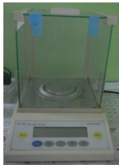
Electronic Weighing Balance

Points to Remember: Always have the knowledge about the maximum and minimum quantity which can be weighed using the balance. Never spill the chemicals on the weighing pan, if it happens wipe off with tissue. Switch off fan and windows nearby when working with it as it may cause fluctuations in the value due to interaction with air density. Always use weigh boats or butter paper to weigh.