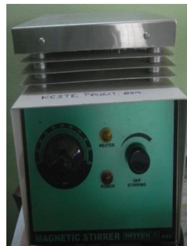
Magnetic Stirrer with Hot Plate

Magnetic stirrers also have drawbacks. For example, the limited size of the stirring bar means it can only be used for relatively small (under 4 liters) experiments. In addition, viscous liquids or thick suspensions are extremely difficult to mix using this method, although there are some stirrers with special magnets to overcome this problem.