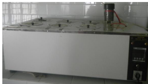
Water Bath with Stirrer

General Description: A water bath is an instrument used in the laboratory for carrying out biochemical, agglutination, inactivation and biomedical tests and even for industrial incubation procedures.