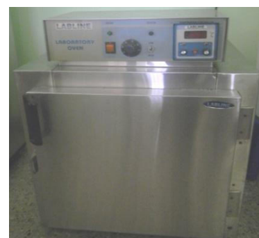
Hot Air Oven

Working Principle of Hot Air Oven is the forced circulation of hot air inside the chamber of oven. As it is a universal scientific fact that in any chamber hot air rises above, so by utilizing this principle when the hot air reaches the top of chamber it is circulated back to bottom by a fan installed inside the chamber and hence optimum amount of heat is achieved gradually inside the Hot Air Oven.